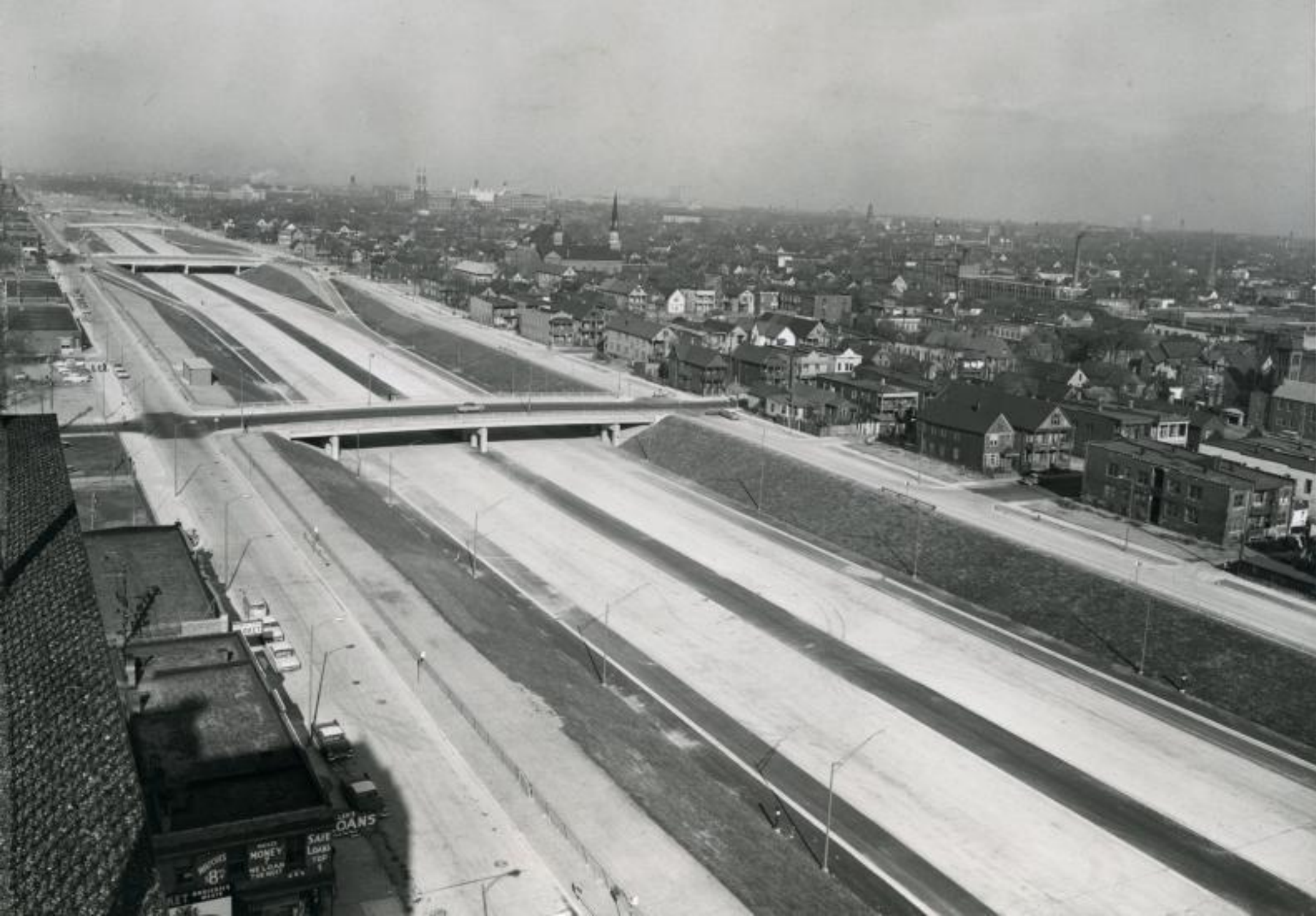
Looking north along the Chrysler Freeway in 1961 from Hastings Street.