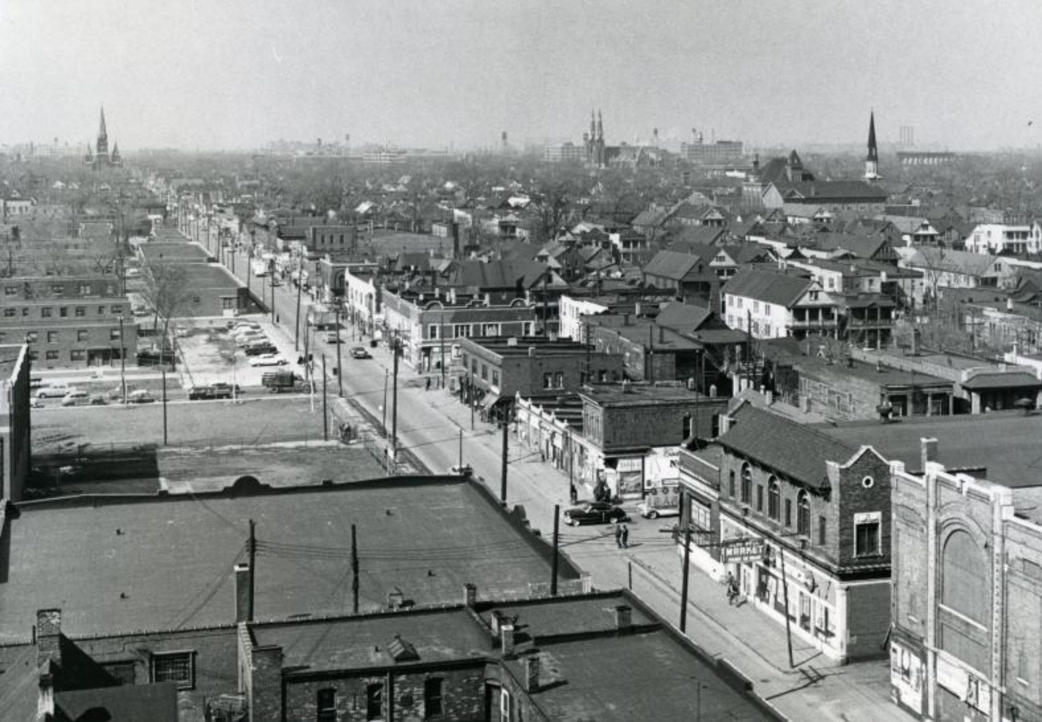
An aerial view of Hastings Street looking north from Mack and St. Antoine in 1959.